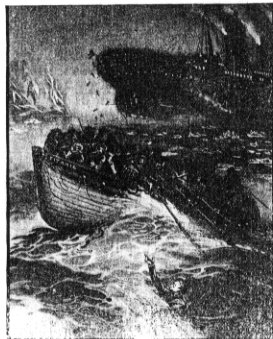
AFTER THE LAST BOAT WAS LOADED.

An unusual demand for this book is assured not only by its complete, reliable and vivid character, but also by its special features of permanent value, which include accounts of other great marine disasters, a record of the development of shipbuilding in the attainment of speed and luxury, an interesting description of safety and life-saving devices used on shipboard, and a critical review of the causes of great marine disasters, with a statement of the legal and other regulations needed to insure greater safety in the future.