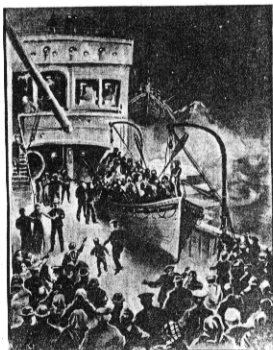
LOWERING THE BOATS. "Women and Children First"

Over 350 pages, over 50 illustrations, bound in cloth, with inlay